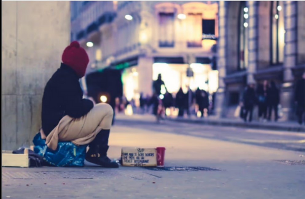
Australia's homelessness crisis and what is being done to solve it ? Homelessness in Australia - The causes and potential solutions Dharma Care / Jul 6, 2022