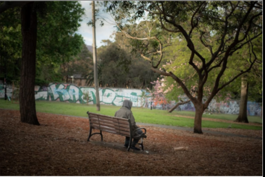
Homeless: Hidden in Plain Sight - Livingston Armytage's new book invites us to look into the eyes of people in... Livingston Armytage compelling photographic series, shot on the streets of Sydney, Australia, Homeless: Hidden in Plain Sight. Dharma Care / Nov 30, 2022