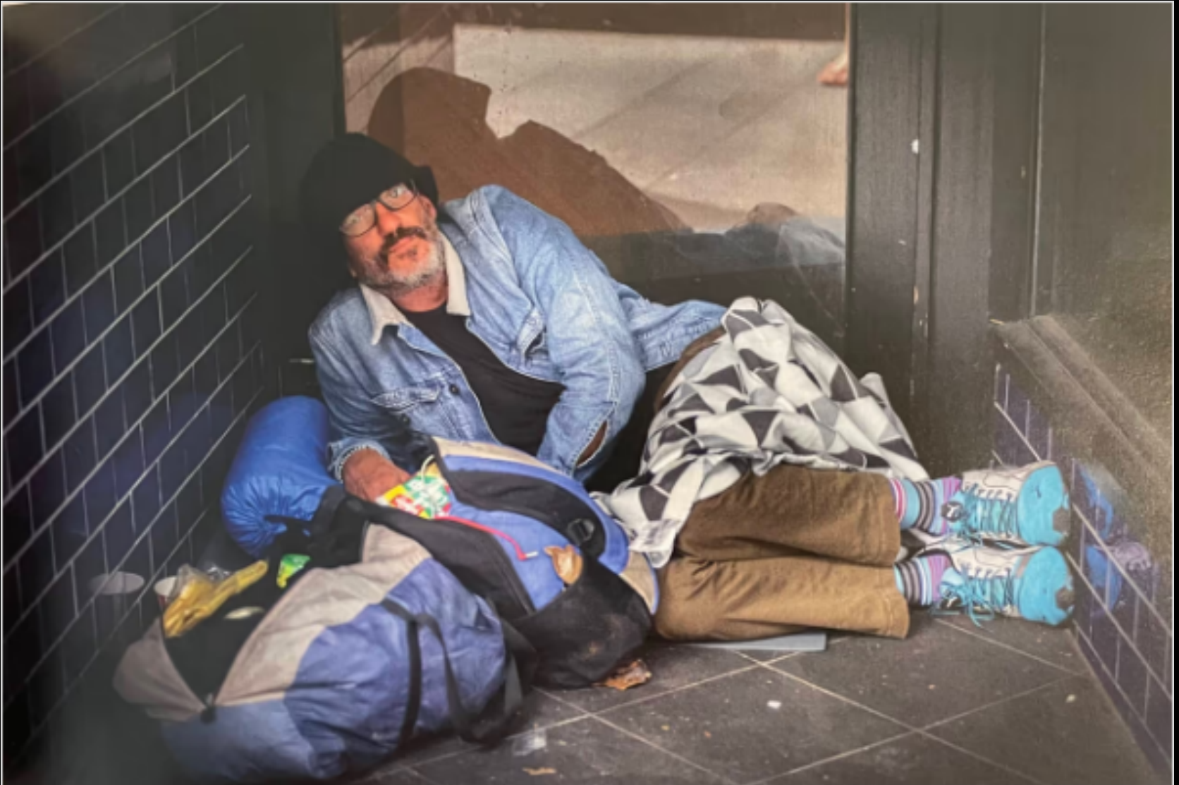
Dharma Care's Global Impacts In The Communities We Serve From health and education to disaster recovery and homelessness, the results speak volumes about the power of collective action and compassion.